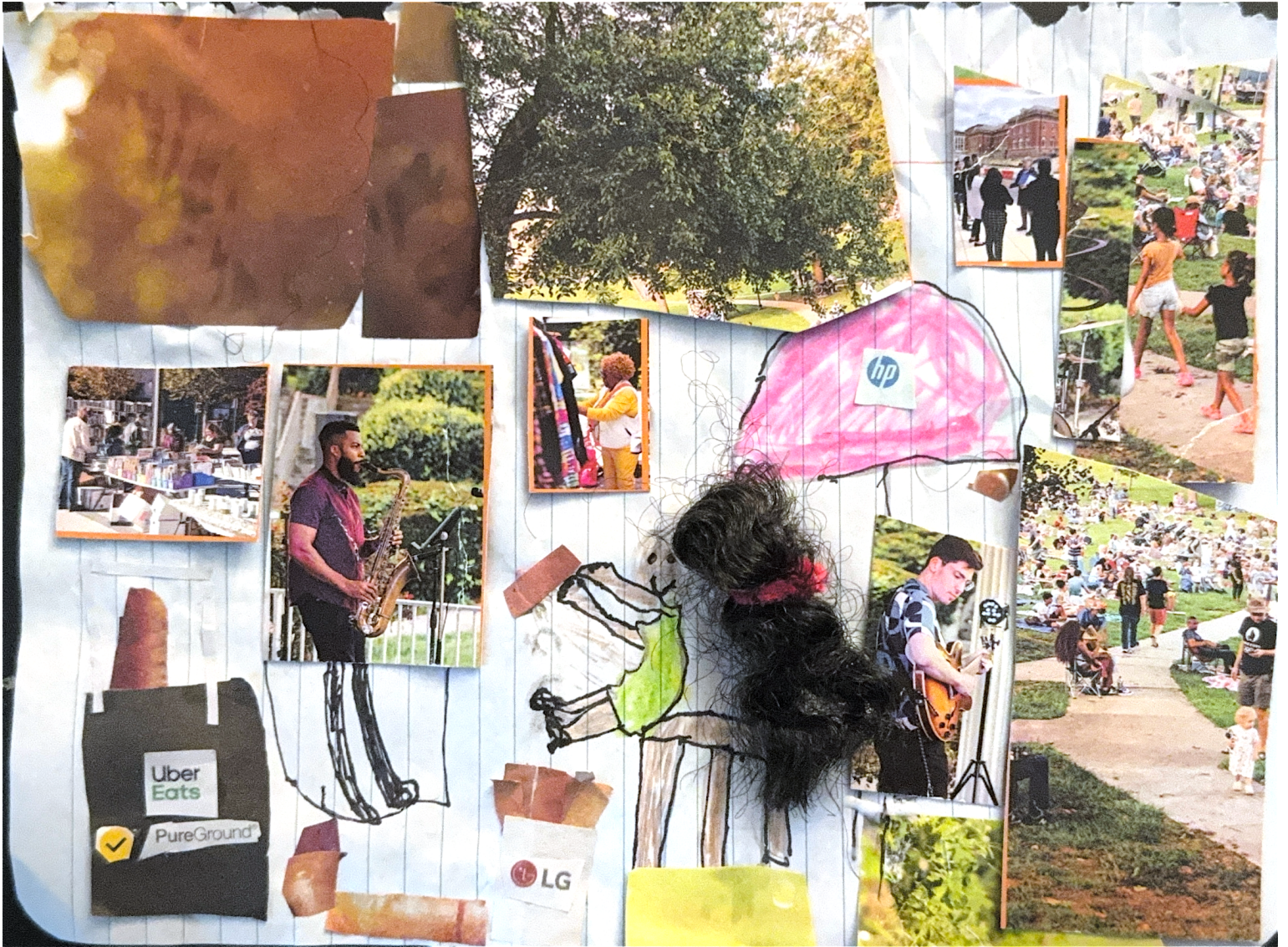
COLLAGE: EATING AT THE ARTS AND MUSIC FESTIVAL

And, I, the girl middle child, does not want ANY of my siblings, including me, to go outside without an adult's supervision so we don't get kidnapped. So I went inside to grab a snack too. Then my family and I went to the park for the arts and music festival.