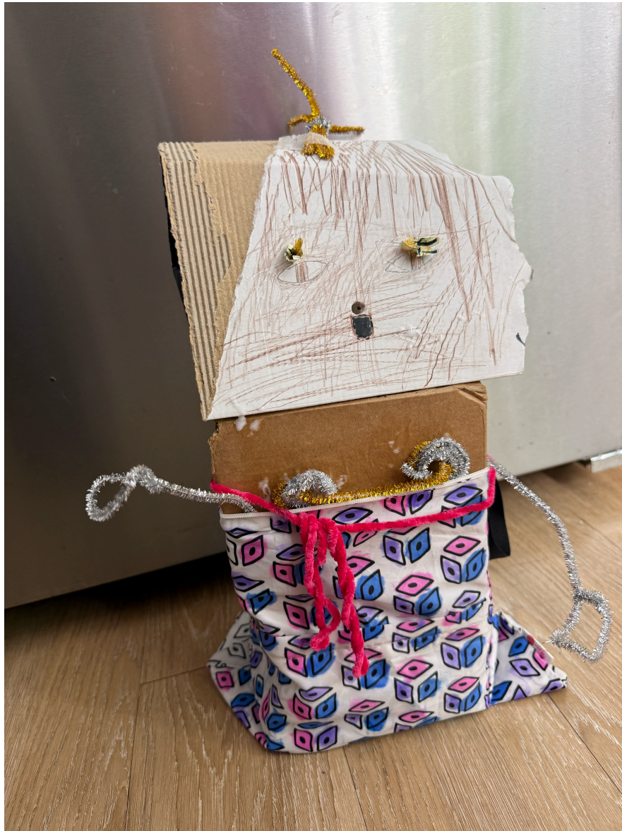
3D ART PIECE: PRINCESS SYMPHONY

Illustrator/Photographer/Designer/Artist: Symphony West