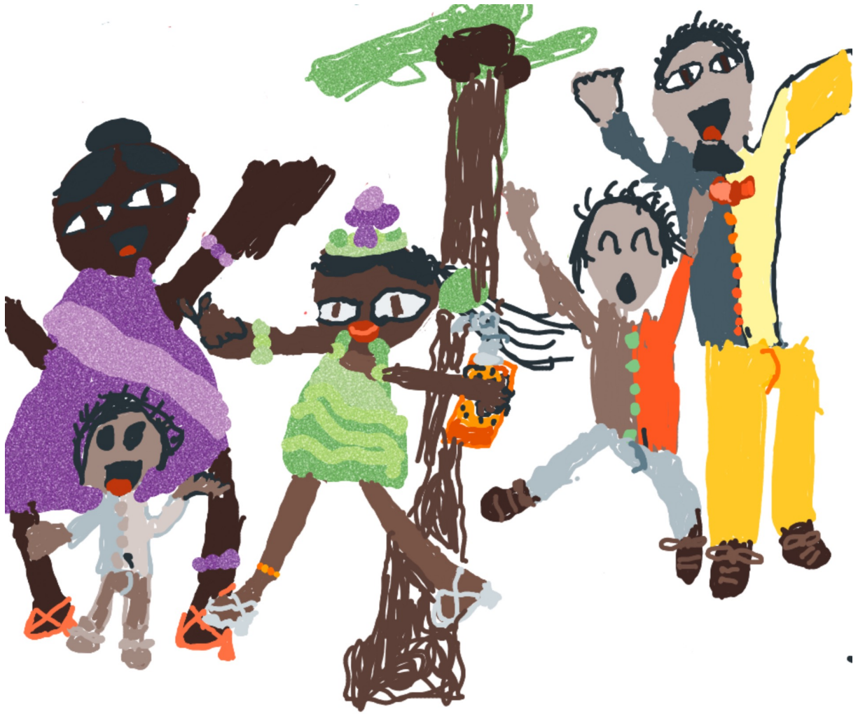
DRAWING: FAMILY VACATION

And when we go somewhere fun, like a family vacation, amazing, wonderful and fun are some of the only words I think about. One thing that makes me the princess is that I get to wear dresses, high heels, and sometimes even tiaras. I also have girl's day with my mom, and daddy daughter day with my dad. Fun fact, I'm the only granddaughter and the only niece. And, most of my friends are the princesses of their houses too!